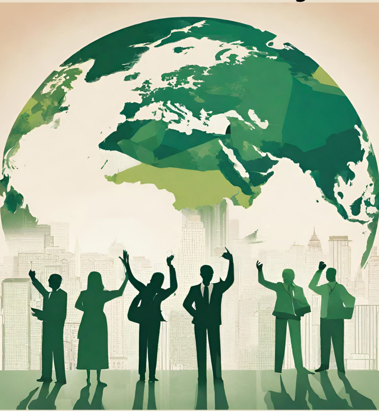
Environment and Climate Change