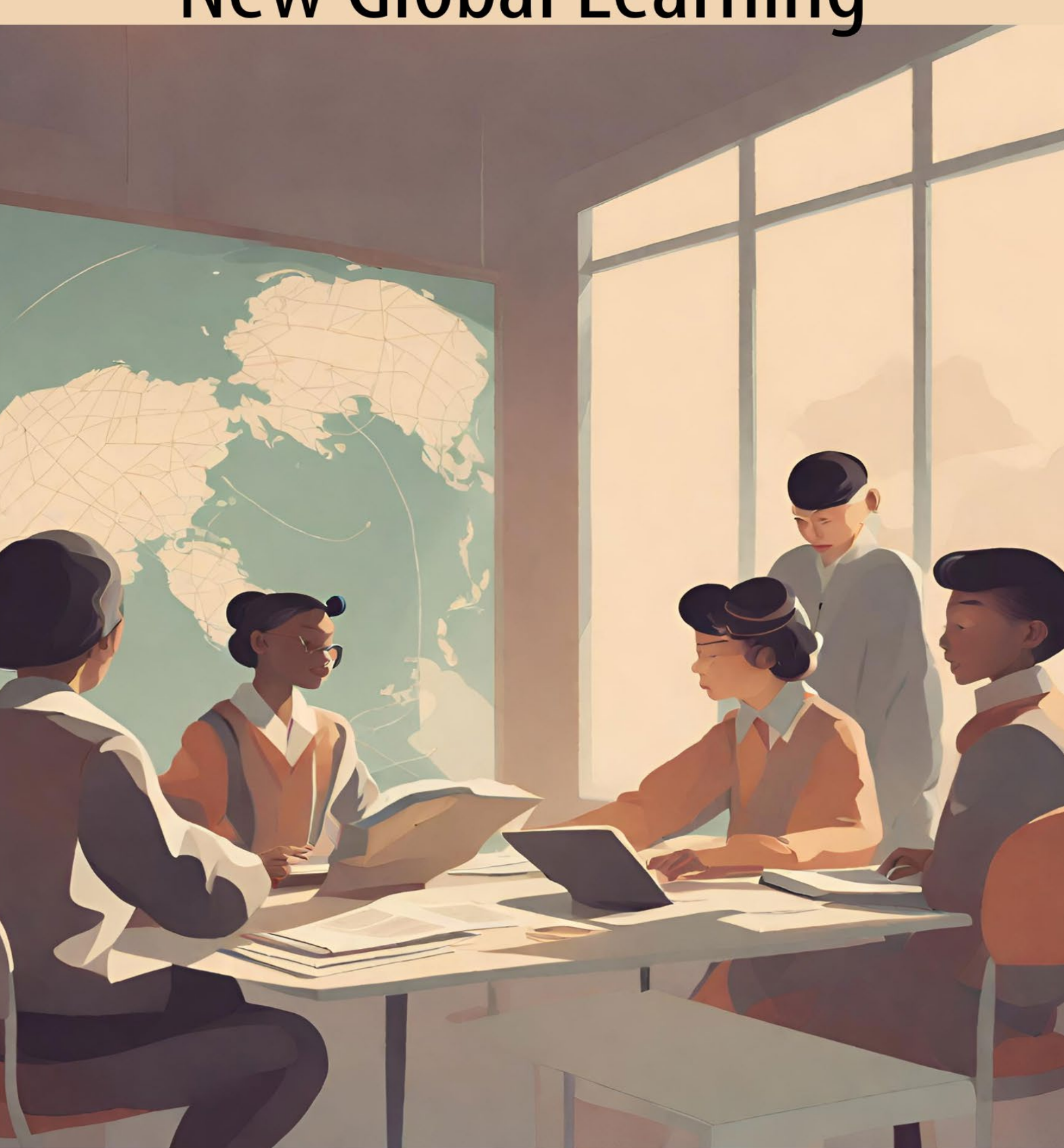
Identity, Culture, Religion, and Border Crossings